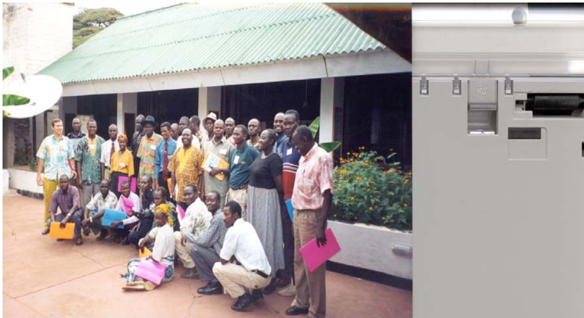
Participants for the Karamoja workshop pose for a photograph at the end of the workshop

The workshop used an Output-oriented participatory approach. The content of the workshop were structured around three complementary themes consisting of participatory lectures, group discussions and plenary discussions.